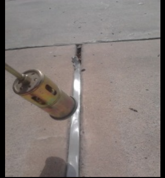
Simply Re-heat to Repair any areas

KwixSeal™ offers a custom-fit, immediate use, long lasting & durable expansion joints.