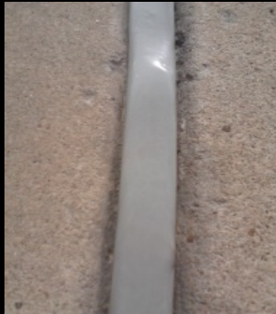
Traffic Ready in Minutes