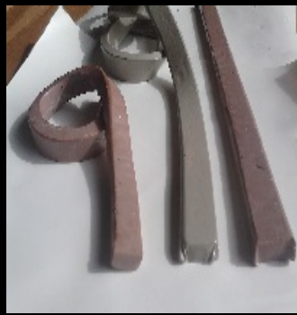
Custom Colors & Textures