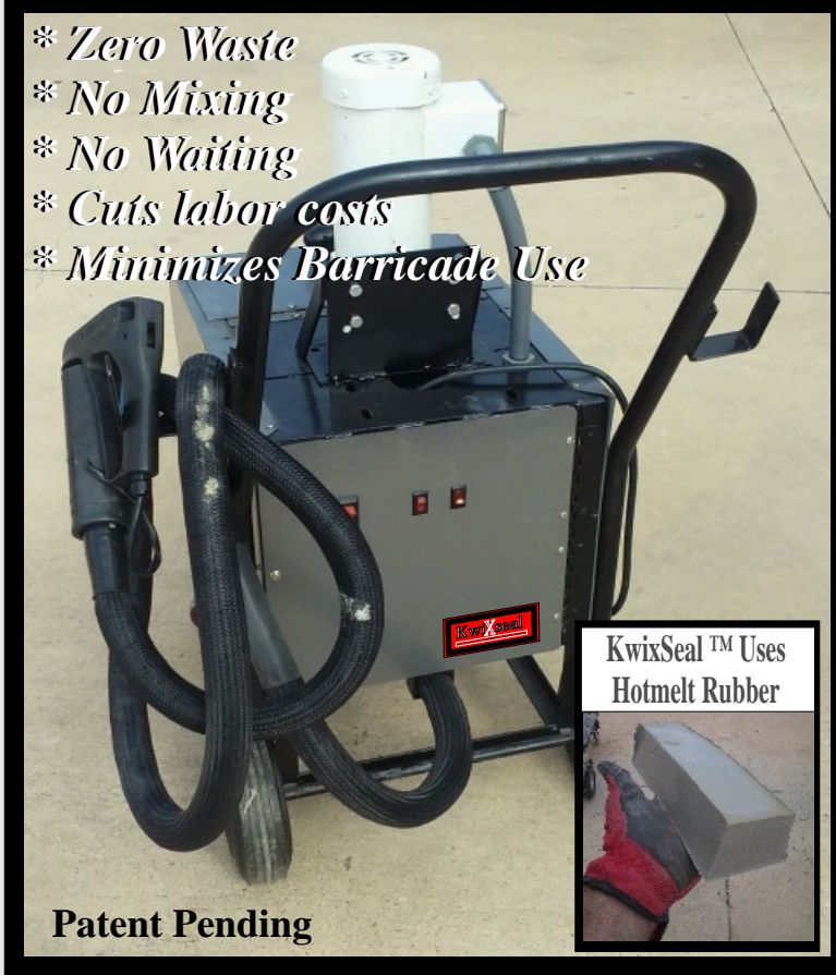
KwixSeal™ Uses Hotmelt Rubber