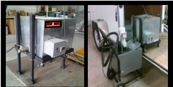
Optional 100 lb. Material Hopper available for convenient refilling.

For use on driveways, sidewalks, shopping centers, office buildings & more!