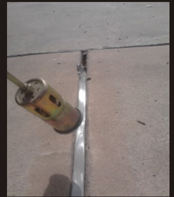
FAST / EASY REPAIRS