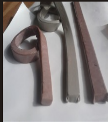
CUSTOM COLORS AVAILABLE