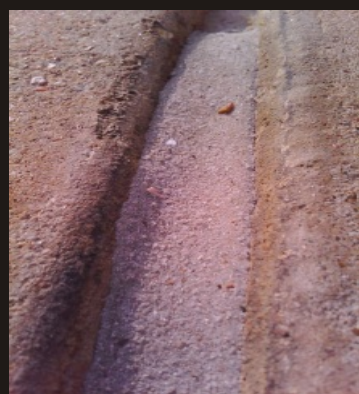
SAND TEXTURE (OPTIONAL)