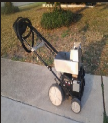
HOT APPLIED MATERIAL