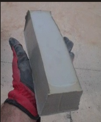
RUBBER MELTS WHEN HEATED