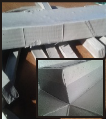
VARIETY OF SIZES AVAILABLE